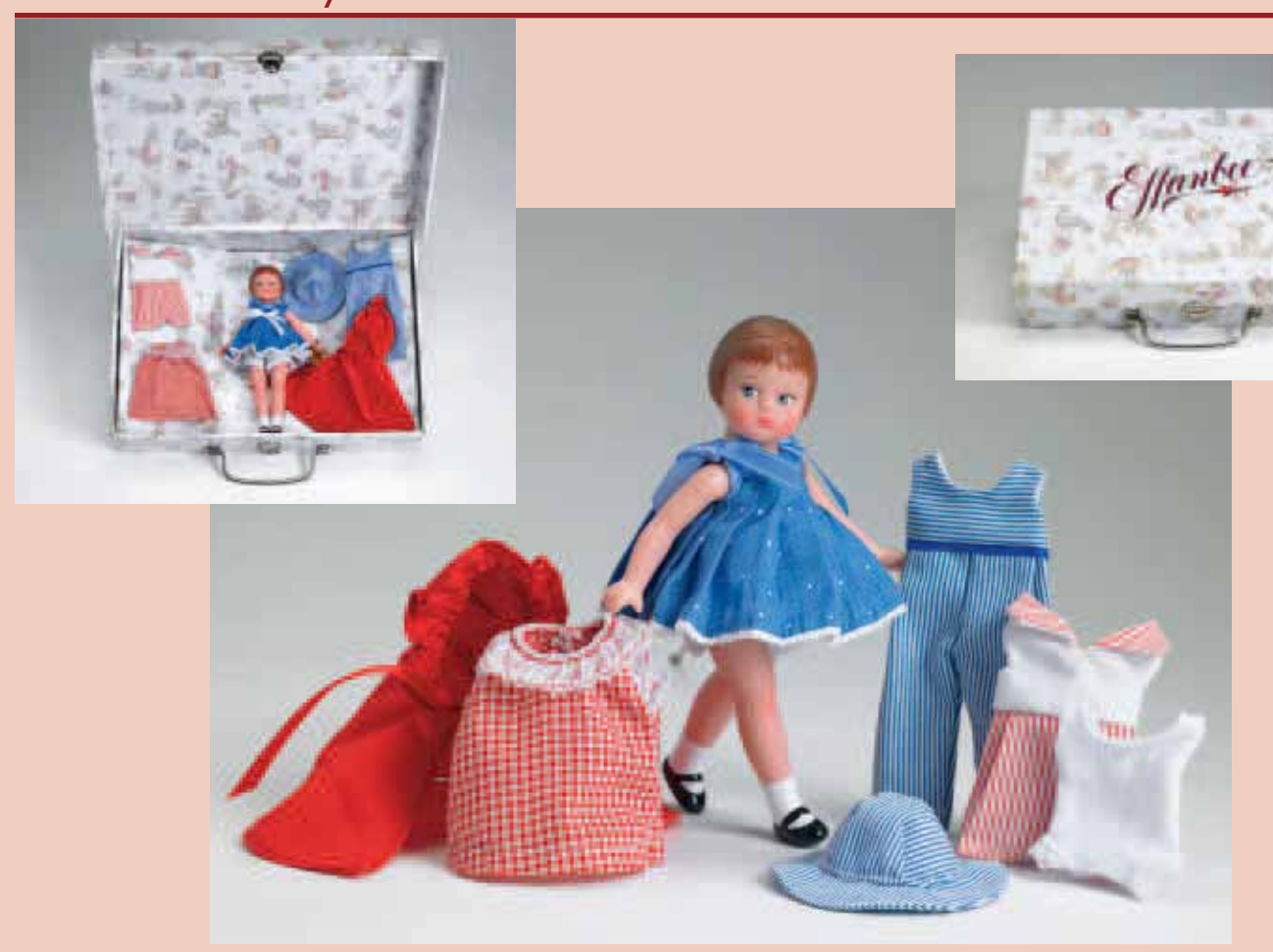
Wee Patsy<sup>™</sup> Travel Case DRESSED DOLL E6-WPDD-06 LE 300 $59.99