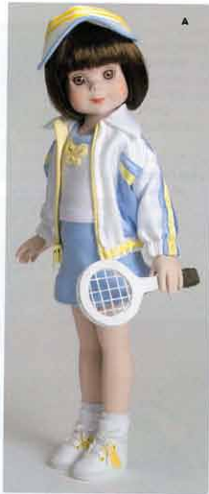
A. 14" Tennis, Anyone? OUTFIT ONLY BM 8401 LE 1000 $34.99