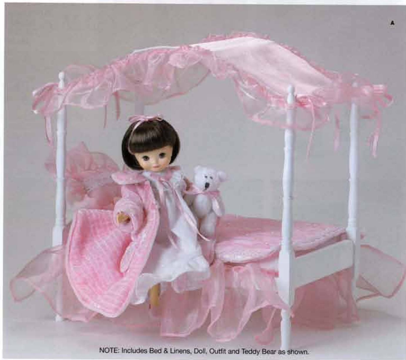
NOTE: Includes Bed & Linens, Doll, Outfit and Teddy Bear as shown.