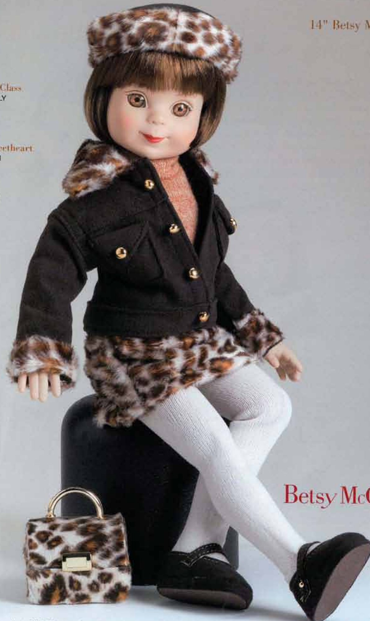
C. 14" Sweetheart Dressed Doll BM 1401 LE 1000 $89.99 (Shown Left)