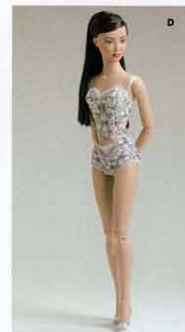
A. Ready-To-Wear Runway Esmé AR STYLE BASIC DOLL TW 2401 ANNUAL $59.99