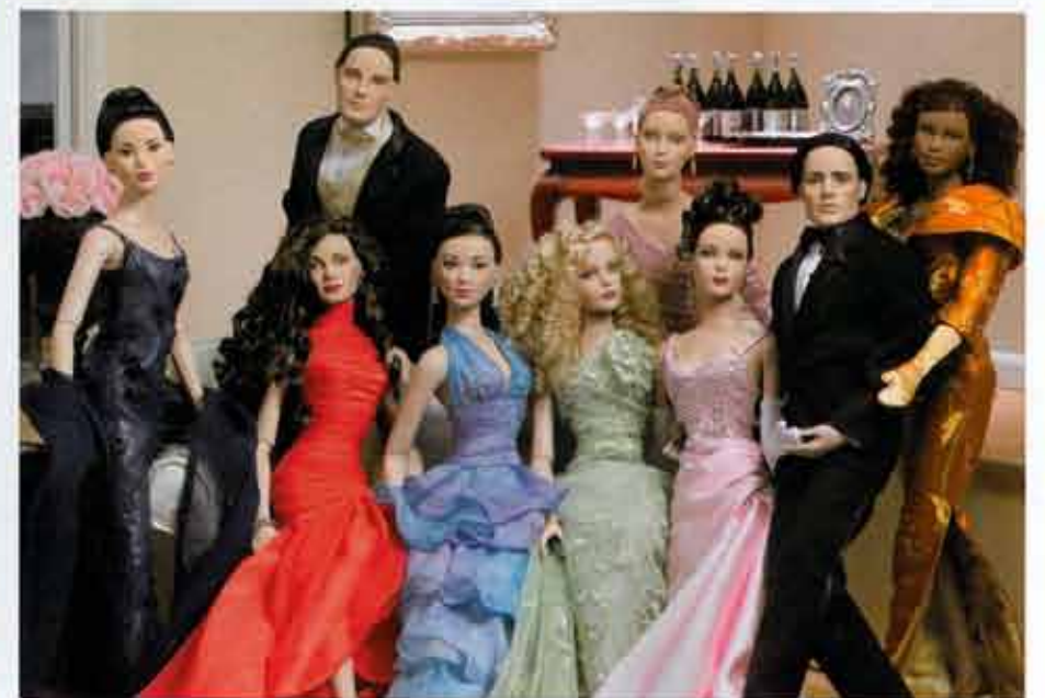
Tyler Wentworth® and Matt O'Neill™, and all their friends and family! (NOTE: Not all dolls are available as shown)