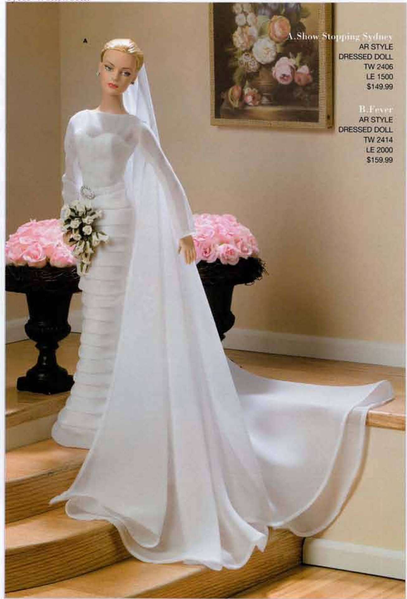
A. Show Stopping Sydney

AR STYLE DRESSED DOLL TW 2406 LE 1500 $149.99