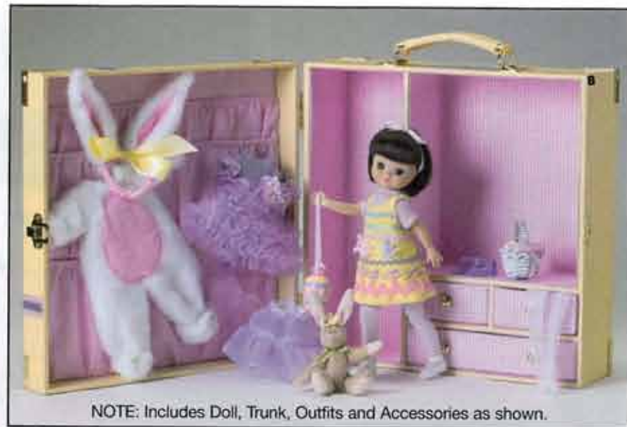
NOTE: Includes Doll, Trunk, Outfits and Accessories as shown.