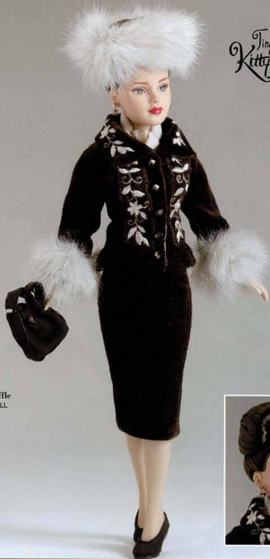
Cocoa Truffle DRESSED DOLL KT 1406 LE 2000 $89.99