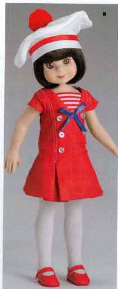
B. 14" Nautical Neat OUTFIT ONLY BM 8403 LE 1000 $34.99