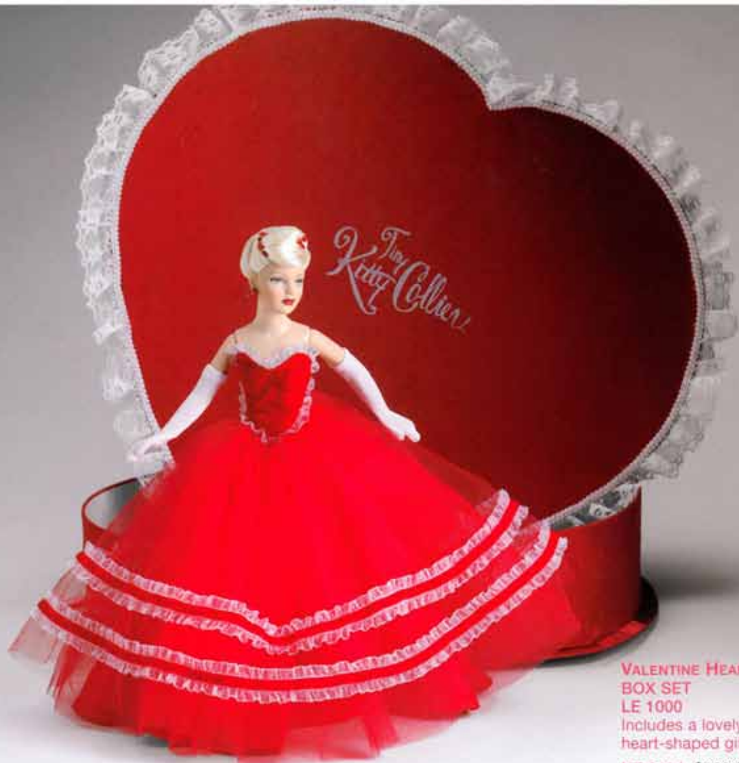
VALENTINE HEARTS BOX SET LE 1000 Includes a lovely heart-shaped gift box! KT 6404 $129.99