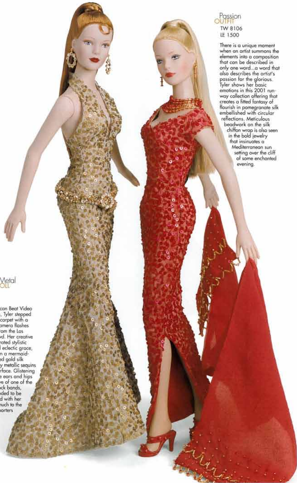
Precious Metal DRESSED DOLL TW 1103 LE 2000