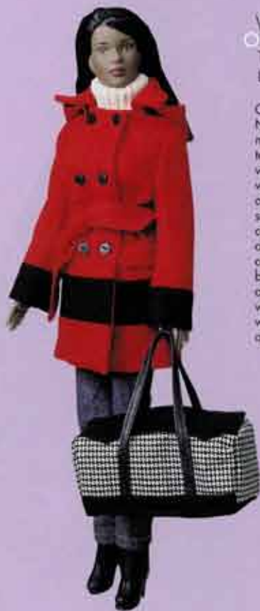
Weekend Retreat OUTFIT ONLY TW 8012 LE 3000

Tyler was determined to make a memorable entrance at Chase Modeling Agency's annual spring cocktail party. Although dozens of beautiful models attended the event, Tyler held her own wearing a champagne-colored silk bubble dress, the bodice of which was hand beaded with gold beads and pearls. Much to her delight, she noticed that many of the models were wearing House of Wentworth designs. The newest model at the agency, Tyler's friend Esmé, also created quite a sensation.