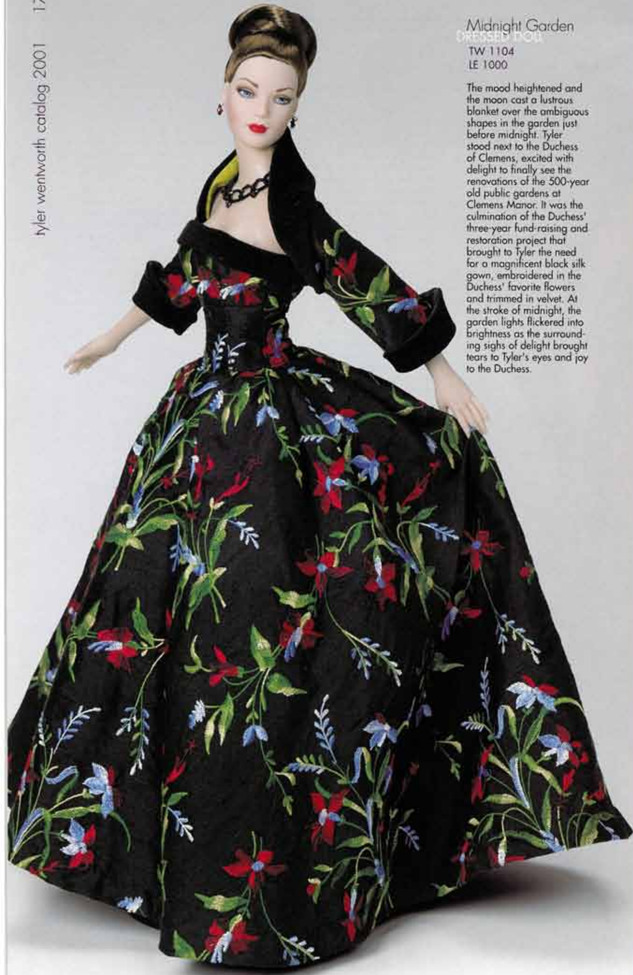
Midnight Garden DRESSED DOLL TW 1104 LE 1000

The mood heightened and the moon cast a lustrous blanket over the ambiguous shapes in the garden just before midnight. Tyler stood next to the Duchess of Clemens, excited with delight to finally see the renovations of the 500-year old public gardens at Clemens Manor. It was the culmination of the Duchess' three-year fund-raising and restoration project that brought to Tyler the need for a magnificent black silk gown, embroidered in the Duchess' favorite flowers and trimmed in velvet. At the stroke of midnight, the garden lights flickered into brightness as the surrounding sighs of delight brought tears to Tyler's eyes and joy to the Duchess.