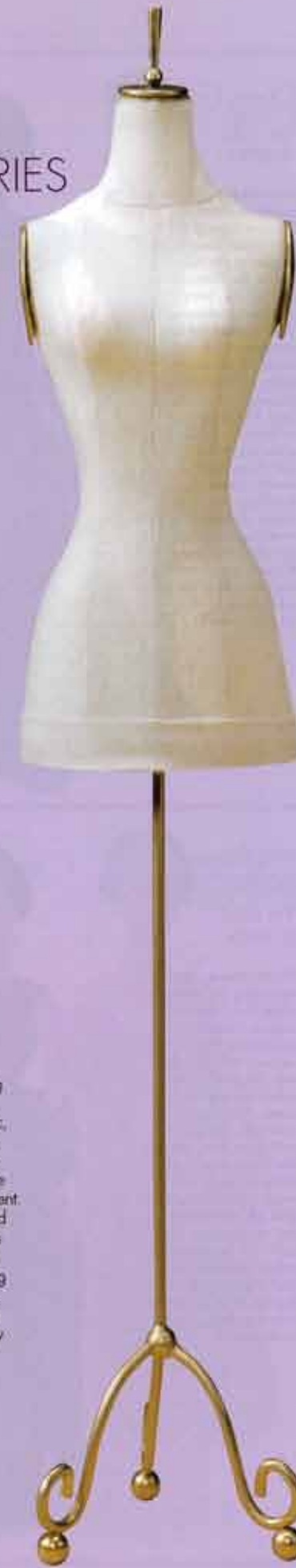
Dress Form ACCESSORIES TW AC 001

Tyler designs by sketching and draping. When inspired by luxurious fabric, she often goes directly to her muslin covered dress form to pin and shape the cloth into the desired garment. Tyler's dress form is scaled exactly to her proportions so that it can be used for either display or the fitting of original designs. The body of this dress form is soft foam covered in tightly stretched muslin with a "gold" stand.