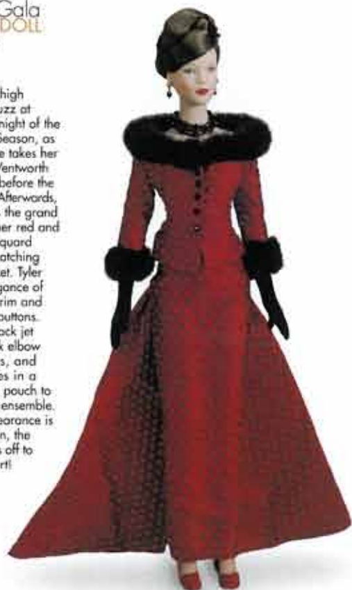
Manhattan Music Awards OUTFIT ONLY TW 8010 LE 3000

Manhattan's high society is abuzz at the opening night of the new Opera Season, as is Tyler as she takes her seat in the Wentworth box minutes before the curtain rises. Afterwards, she descends the grand staircase in her red and black silk jacquard gown with matching cropped jacket. Tyler loves the elegance of its black fur trim and glittering jet buttons. She chose black jet jewelry, black elbow length gloves, and opera glasses in a matching silk pouch to complete the ensemble. If Tyler's appearance is any indication, the new season is off to a brilliant start!