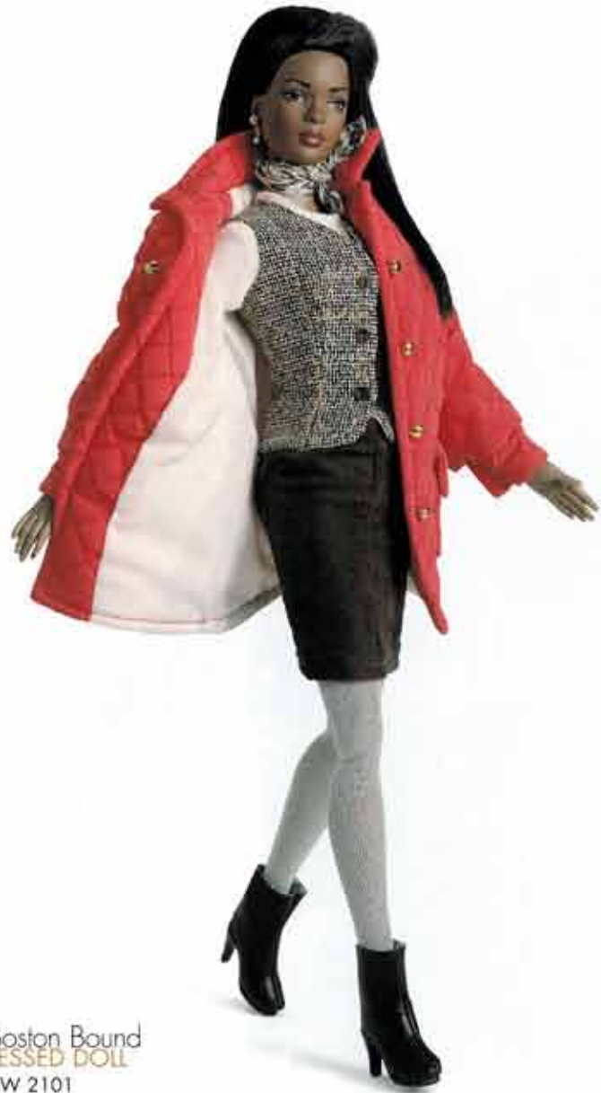
Boston Bound DRESSED DOLL TW 2101 LE 2000

Esmé hit the runway as the first model of Tyler Wentworth's 2001 Sportswear runway show. Tailored themes of Bostonian student vests and an updated contemporary version of the classic corduroy skirt brought warmth to the ensemble over a winter-white bodysuit and cream tights. Wrap all this up with a coral diamond-quilted coat with big pockets and the casual takes on a dressy appearance for the season. Ankle boots and a printed scarf provide the final notes to this jazzy composition. The outfit was such a natural for Esmé that it's no surprise she was recently seen wearing the same outfit while visiting friends in Boston.