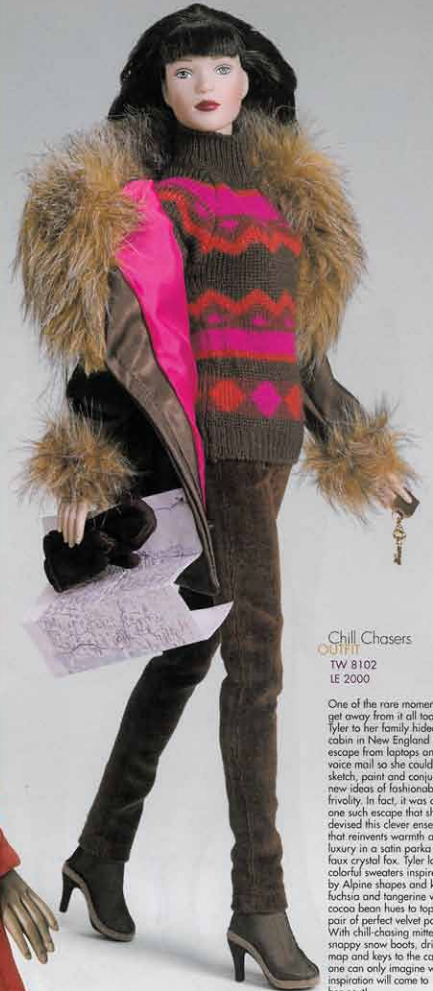
Chill Chasers OUTFIT TW 8102 LE 2000

One of the rare moments to get away from it all took Tyler to her family hideaway cabin in New England to escape from laptops and voice mail so she could sketch, paint and conjure new ideas of fashionable frivolity. In fact, it was on one such escape that she devised this clever ensemble that reinvents warmth and luxury in a satin parka with faux crystal fox. Tyler loves colorful sweaters inspired by Alpine shapes and knits fuchsia and tangerine with cocoa bean hues to top a pair of perfect velvet pants. With chill-chasing mittens, snappy snow boots, driving map and keys to the cabin, one can only imagine what inspiration will come to her next!