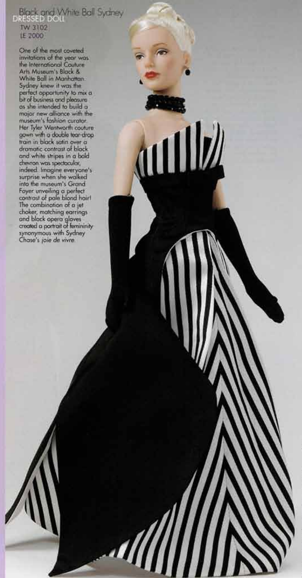
Black and White Ball Sydney DRESSED DOLL TW 3102 LE 2000

One of the most coveted invitations of the year was the International Couture Arts Museum's Black & White Ball in Manhattan. Sydney knew it was the perfect opportunity to mix a bit of business and pleasure as she intended to build a major new alliance with the museum's fashion curator. Her Tyler Wentworth couture gown with a double tear-drop train in black satin over a dramatic contrast of black and white stripes in a bold chevron was spectacular, indeed. Imagine everyone's surprise when she walked into the museum's Grand Foyer unveiling a perfect contrast of pale blond hair! The combination of a jet choker, matching earrings and black opera gloves created a portrait of femininity synonymous with Sydney Chase's joie de vivre.