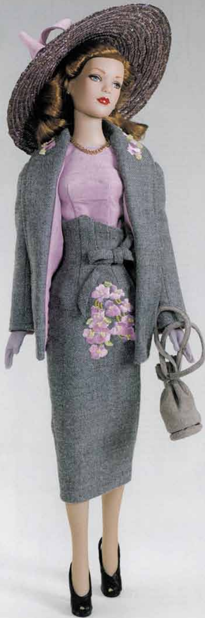
Longchamp Fleuri DRESSED DOLL TDLM 002 LE 3000

Jacques Fath led a strong following of women in love with the freshness and contrasts used in the house's daywear. Drawing themes from Fath ideals, this cool gray wool suit lined in mauve silk pulls dancing embroidered violets into the collar and corselet skirt. Off-centered themes continue to speak through the ensemble's waistline, hip treatments and the floating bow above the broad-brimmed straw hat.