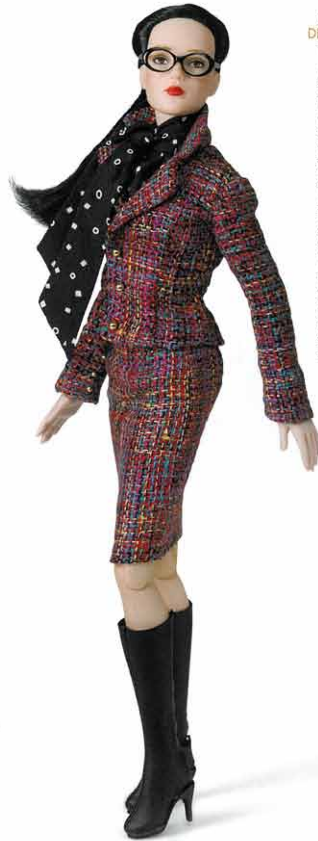
Sydney Chase DRESSED DOLL TW 3101

In a rare relaxed moment, Tyler went into a bookstore to browse. After making her selections, she noticed an incredibly beautiful young woman working behind the counter. Tyler introduced herself to the young woman and found out her name was Esmé. She was a pre-med student who was at first very skeptical about Tyler's suggestion that she model in the upcoming fashion show. Although she had been approached to model before, she never took it seriously. But having heard of Tyler and the House of Wentworth, she thought she would give it a try. After a lengthy conversation with the Chase Modeling Agency, Esmé was booked for her first show - The Tyler Wentworth Collection.