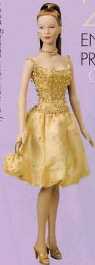
Champagne Bubble OUTFIT ONLY TW 8013 LE 3000

Tyler was determined to make a memorable entrance at Chase Modeling Agency's annual spring cocktail party. Although dozens of beautiful models attended the event, Tyler held her own wearing a champagne-colored silk bubble dress, the bodice of which was hand beaded with gold beads and pearls. Much to her delight, she noticed that many of the models were wearing House of Wentworth designs. The newest model at the agency, Tyler's friend Esmé, also created quite a sensation.