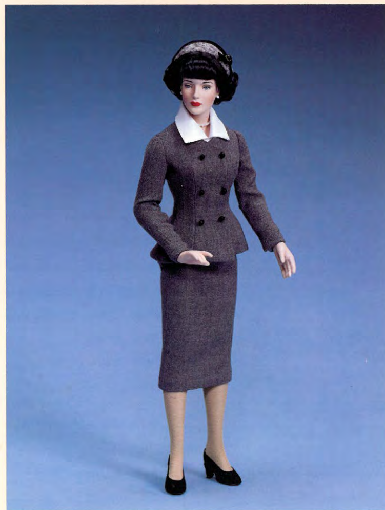
19" Wonder Woman - Porcelain #98407 Limited Edition 500

Wonder Woman is the third doll in the super hero collection. She is an all porcelain doll with hand painted features. She is wearing her "Silver Age" costume. The top of the outfit is embroidered with the American Eagle motif and her shorts are blue with white stars. Wonder Woman has jet black hair and red leather shoes.