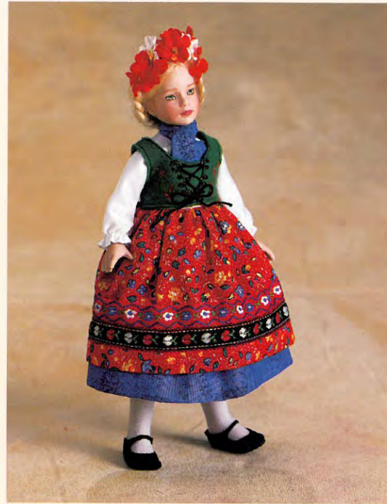
8" Heidi - Porcelain #98203 Limited Edition 500

H eidi has hand painted features and a hand made mohair wig with flower trim that frames her face. Her dress is a traditional Austrian dirndl, with a green felt vest embroidered with Edelweiss.