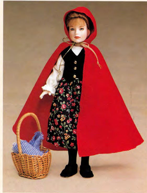
8" Red Riding Hood - Porcelain #98206 Limited Edition 500

D orothy from the Wizard of Oz has hand painted features and a hand made mohair wig. She is wearing her classic blue and white check dress over a white puff sleeve blouse. On her feet are silver slippers and she carries a basket for her trip to Oz.