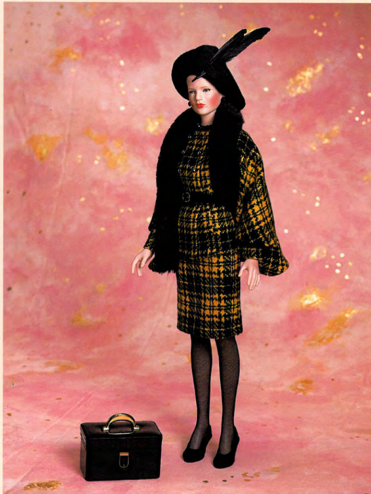
19" Fashion Model - Bailey - Vinyl #98707 Limited Edition 500

E ric is the first male fashion doll in Robert Tonner's American Model Series. He is a 21" hand painted vinyl doll and wears a tuxedo of black wool with satin lapels, a white dress shirt, black tie and black shoes and socks.