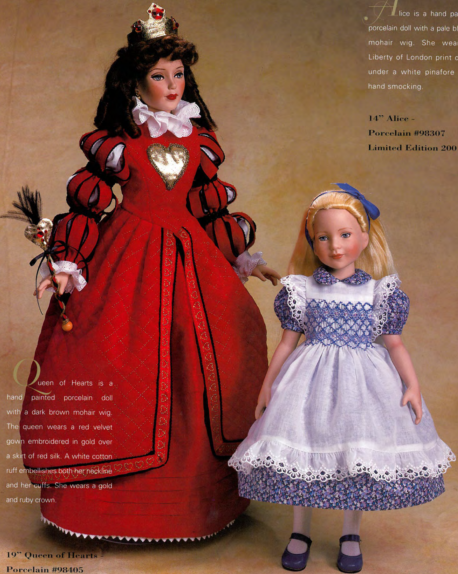
14" Alice - Porcelain #98307 Limited Edition 200

Queen of Hearts is a hand painted porcelain doll with a dark brown mohair wig. The queen wears a red velvet gown embroidered in gold over a skirt of red silk. A white cotton ruff embellishes both her neckline and her cuffs. She wears a gold and ruby crown.