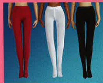
Must Have Tights Set #016-181 $30