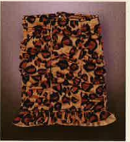
Pulled Together Leopard Skirt 016-170 $26