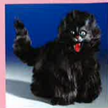
Sybil, Playing Nice? #015-114 $29

Something serious takes over when I'm shopping the city I'm quite focused when looking for items so pretty; Second-hand vests, and skirts, sweaters and tops Small things make me happy – I should own a thrift shop!