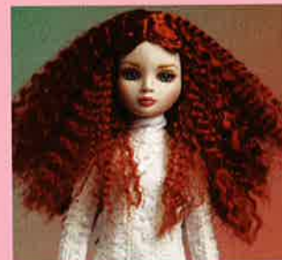
Wild Daze – Red #014-144 $36