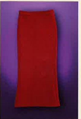
Something Serious Red Skirt 016-166 $22

For more fun Ellowyne Boutique Accessories, please visit www.ellowynewilde.com