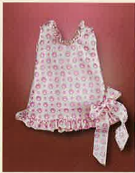
Frills Printed Top 016-158 $26