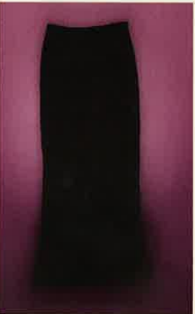
Something Serious Black Skirt 016-168 $22