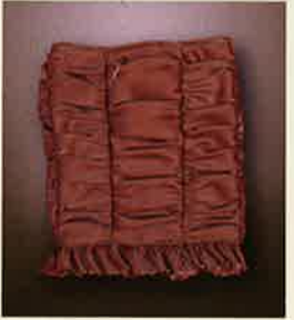
Pulled Together Cross-Dyed Skirt 016-169 $26