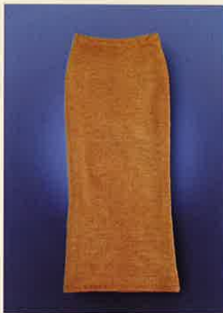
Something Serious Camel Skirt 016-167 $22