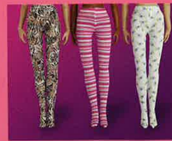
Decision Tights Set #016-180 $30