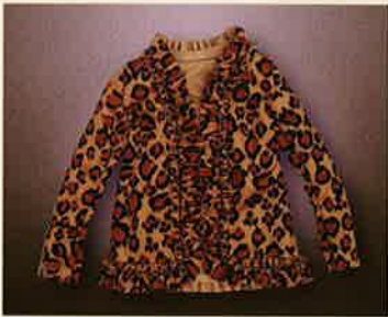
Cardigan Funk Leopard 016-165 $26