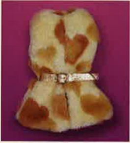
Wild Thing Gold Vest 016-162 $30