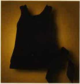
Frills Black Top 016-160 $26