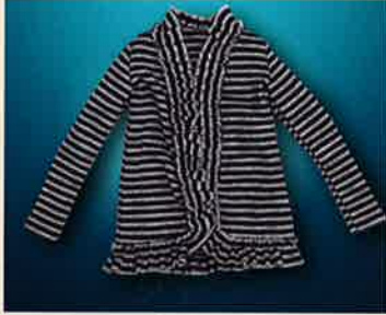
Cardigan Funk Striped 016-163 $26