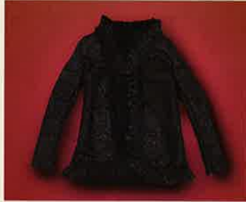
Cardigan Funk Shimmer 016-164 $26