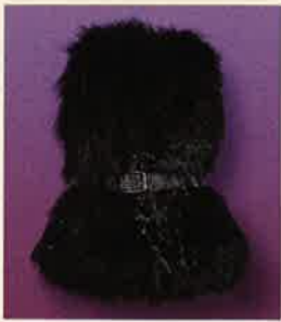
Wild Thing Black Vest 016-161 $30