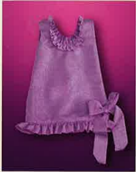
Frills Shimmer Top 016-159 $26