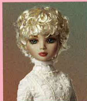
Crazy Crop Platinum #014-147 $30