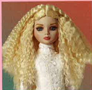
Wild Daze – Blonde #014-145 $36