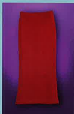
Something Serious Red Skirt 016-166 $22