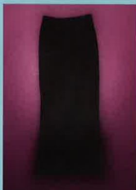
Something Serious Black Skirt 016-168 $22