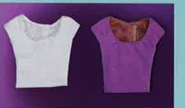
Cut Short Pastel Top Set 016-154 $38