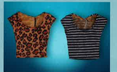
Cut Short Printed Top Set 016-152 $38