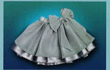
Flippy Sea Foam Skirt 016-172 $25