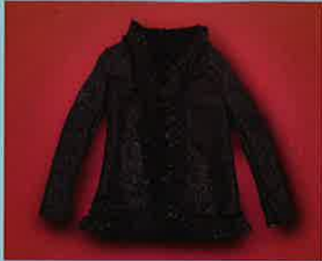
Cardigan Funk Shimmer 016-164 $26

For more fun Ellowyn Boutique Accessories, please visit www.ellownewilde.com