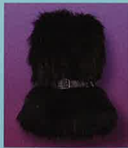
Wild Thing Black Vest 016-161 $30