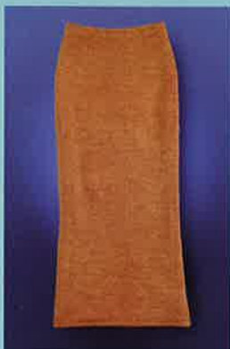
Something Serious Camel Skirt 016-167 $22