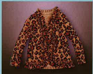
Cardigan Funk Leopard 016-165 $26