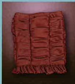
Pulled Together Cross-Dyed Skirt 016-169 $26