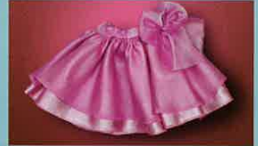
Flippy Lavender Skirt 016-171 $25