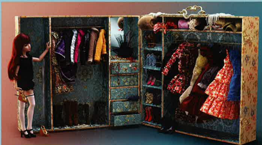
(Doll and clothing shown not included)