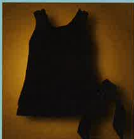
Frills Black Top 016-160 $26