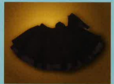
Flippy Black Skirt 016-173 $25