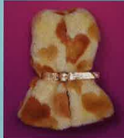
Wild Thing Gold Vest 016-162 $30