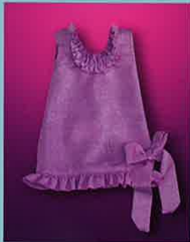
Frills Shimmer Top 016-159 $26