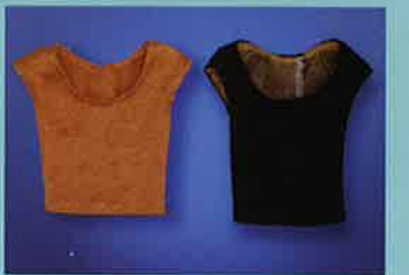
Cut Short Neutral Top Set 016-153 $38