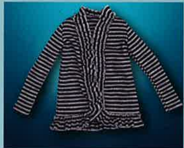
Cardigan Funk Striped 016-163 $26