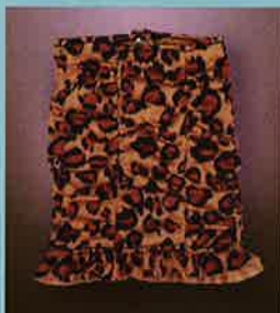
Pulled Together Leopard Skirt 016-170 $26