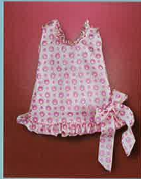
Frills Printed Top 016-158 $26