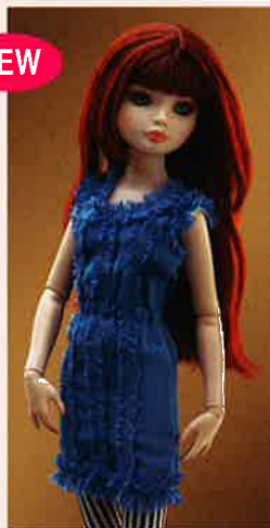
Raw Ruffles Dress #016-140 $39