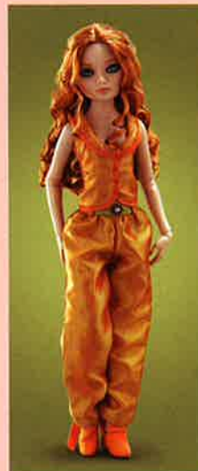
Ennui Yellow Vest #016-128 $22