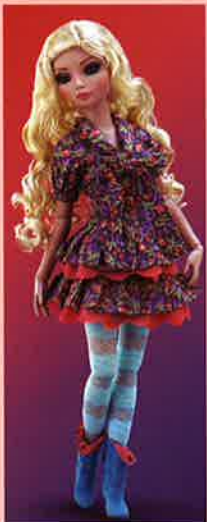
Ennui Purple Print Blouse #016-129 $24

It makes me happy in a strange sort of way To shop for clothes that others gave away; A skirt, a jacket, a dress or some tops Small gifts to me from my favorite THRIFT SHOPS