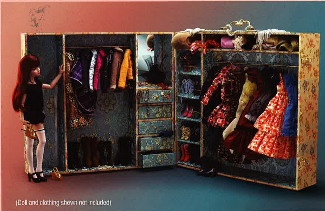
(Doll and clothing shown not included)