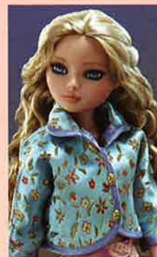
Ennui Blue Satin Jacket #016-137 $38