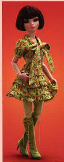
Ennui Green Print Blouse #016-135 $24