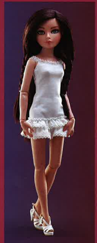
ESSENTIAL ELLOWYNE, FOUR – BRUNETTE