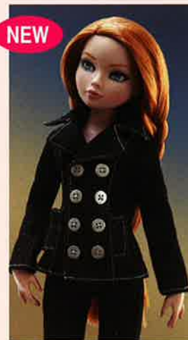
Blustery Peacoat #016-146 $42