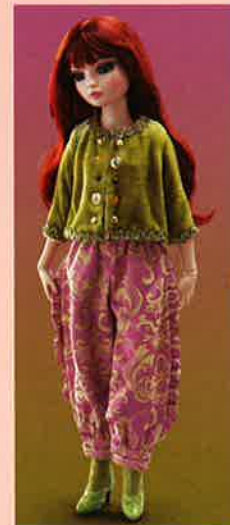
Ennui Green Jacket #016-136 $38