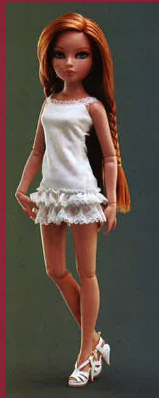
ESSENTIAL ELLOWYNE, FOUR – RED HEAD