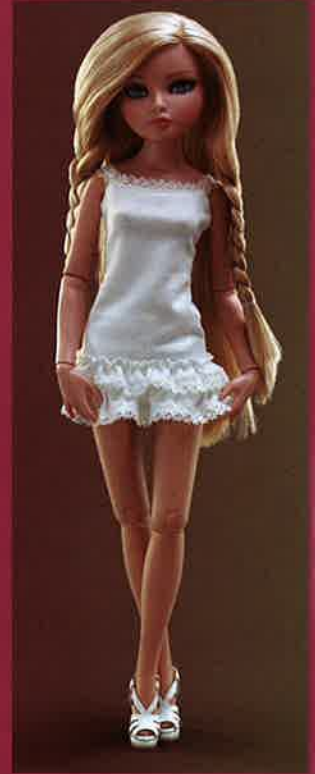
ESSENTIAL ELLOWYNE, FOUR – BLONDE

Each Essential Ellowyne, Four comes dressed in a short white designer slip with bottom ruffles, panties, sheer stockings and matching sandals. With rooted hair, styled just right, and painted green eyes, these are definitely our newest Ellowyne basics with a mood. Designer saddle stand also included.