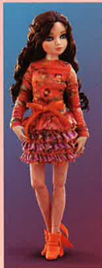
Ennui Orange Print Blouse #016-127 $24