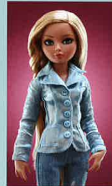
Hanging by a Thread Seafoam Jacket #016-141 $38