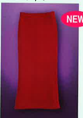
Something Serious Red Skirt 016-166 $22