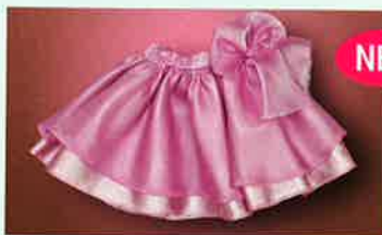
Flippy Lavender Skirt 016-171 $25