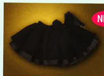
Flippy Black Skirt 016-173 $25