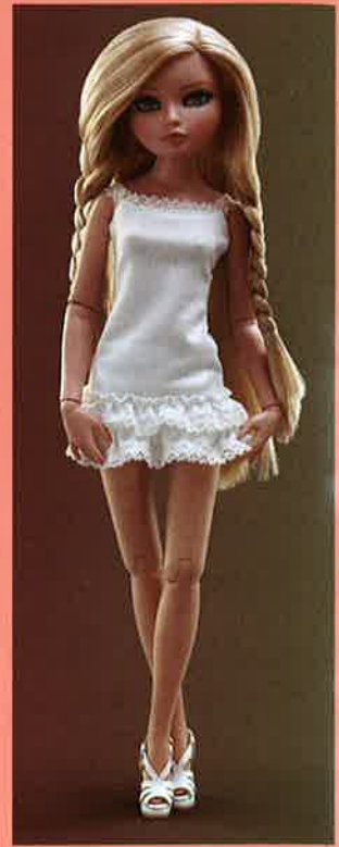
ESSENTIAL ELLOWYNE, FOUR – BLONDE

Each Essential Ellowyne, Four comes dressed in a short white designer slip with bottom ruffles, panties, sheer stockings and matching sandals. With rooted hair, styled just right, and painted green eyes, these are definitely our newest Ellowyne basics with a mood. Designer saddle stand also included.