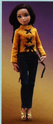
Crossed Purposes Jacket #016-144 $38 Distress Call Dark Jeans #016-149 $29