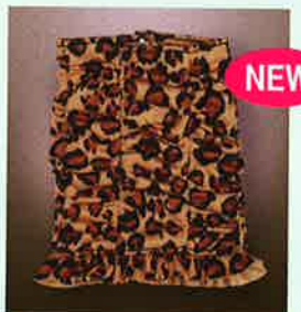
Pulled Together Leopard Skirt 016-170 $26