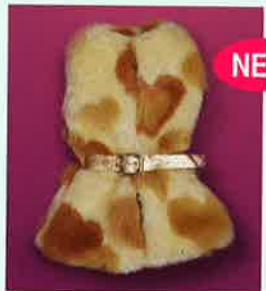
Wild Thing Gold Vest 016-162 $30