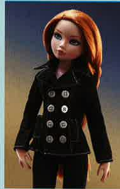
Blustery Peacoat #016-146 $42