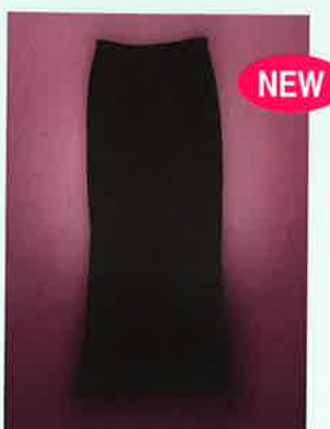
Something Serious Black Skirt 016-168 $22