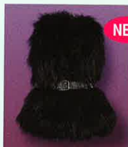
Wild Thing Black Vest 016-161 $30