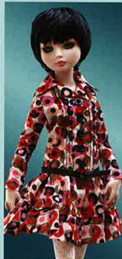
Round & Round Dress #016-139 $39