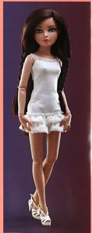
ESSENTIAL ELLOWYNE, FOUR – BRUNETTE