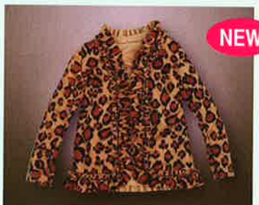
Cardigan Funk Leopard 016-165 $26