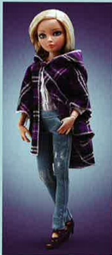
Warding Off A Chill Poncho #016-147 $42 Distress Call Blue Jeans #016-148 $29