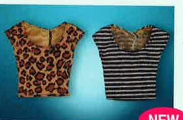
Cut Short Printed Top Set 016-152 $38