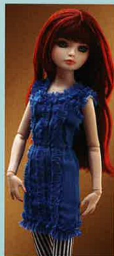
Raw Ruffles Dress #016-140 $39