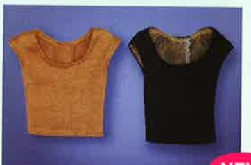
Cut Short Neutral Top Set 016-153 $38