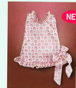
Frills Printed Top 016-158 $26