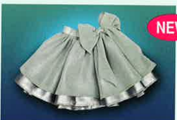
Flippy Sea Foam Skirt 016-172 $25