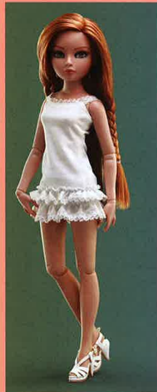
ESSENTIAL ELLOWYNE, FOUR – RED HEAD