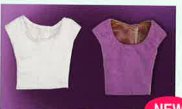
Cut Short Pastel Top Set 016-154 $38