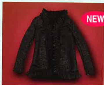
Cardigan Funk Shimmer 016-164 $26