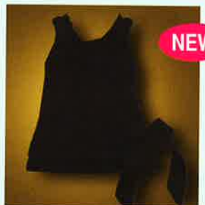
Frills Black Top 016-160 $26