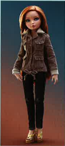
Inclement Jacket #016-145 $42 Distress Call Black Jeans #016-150 $29