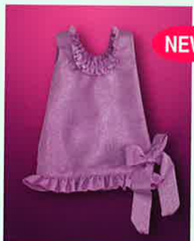
Frills Shimmer Top 016-159 $26