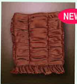
Pulled Together Cross- Dyed Skirt 016-169 $26