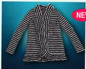
Cardigan Funk Striped 016-163 $26