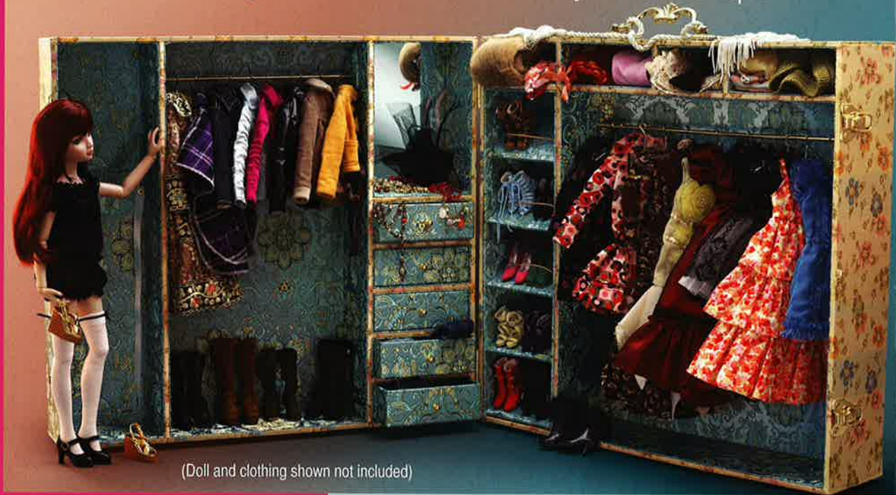
(Doll and clothing shown not included)

It makes me happy in a strange sort of way To shop for clothes that others gave away; A skirt, a jacket, a dress or some tops Small gifts to me from my favorite THRIFT SHOPS