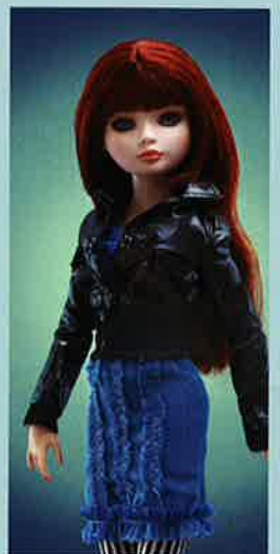
Trouble? Jacket #016-143 $38