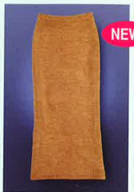
Something Serious Camel Skirt 016-167 $22