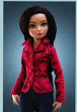
Hanging by a Thread Fuchsia Jacket #016-142 $38