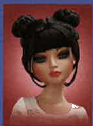
BORED 014-121 $25