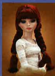
EXPECTATIONS 014-120 $25