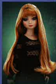
HOPE 014-115 $25

My spirits wilt just like a rose; My pretty poem is at a close