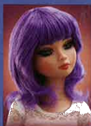
DREAMS 014-116 $25