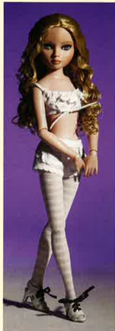
ESSENTIAL ELLOWYNE, TOO BLONDE #010-106 $74.00

They say that loneliness is a sad affair But for me it's just normal and I really don't care; Yet my vanity mirror confirms a girl so blue And I just stare at the image of ESSENTIAL ELLOWYNE, TOO