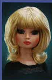
DISSATISFACTION 014-124 $25