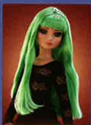
JADED 014-123 $25