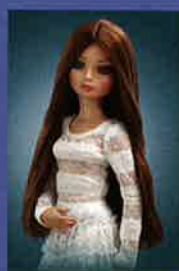
REALITY 014-118 $25