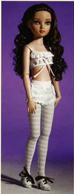
ESSENTIAL ELLOWYNE, TOO BRUNETTE #010-107 $74.00

Each Essential Ellowynne, Too comes dressed in a designer two piece set, striped stockings, and lace-up shoes. New designer saddle stand also included.