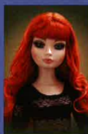
WISHES 014-117 $25