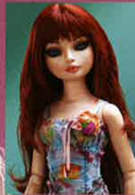
DARK RED WIG