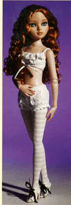
ESSENTIAL ELLOWYNE, TOO REDHEAD #010-108 $74.00