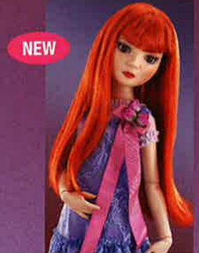
BRIGHT RED WIG

Purple and pink makes me smile My looks I change every once in awhile; I never complain or even pout I'm ESSENTIAL PRUDENCE, TOO and totally WIGGED OUT!