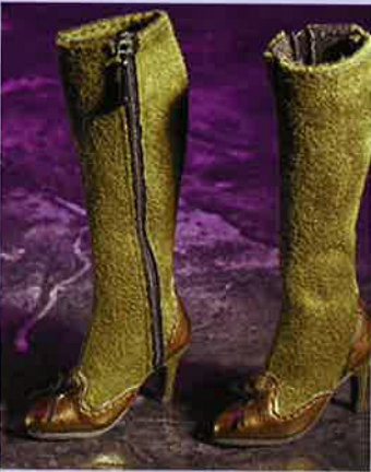
Pacific Heights #014-101 $26.00