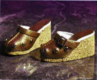
Golden Gaits #014-104 $22.00