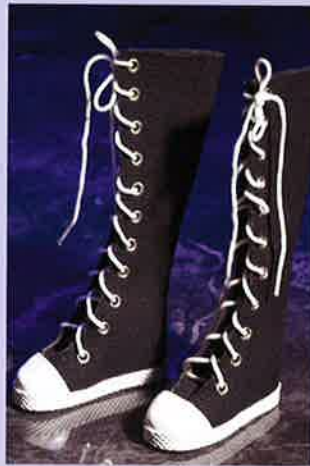
Retro Runners #014-110 $24.00

CALL TOLL FREE TO ORDER 1-866-90-WILDE M-F 8:30 a.m. to 5:30 p.m. EST Shop 24/7 at www.ellowynewilde.com