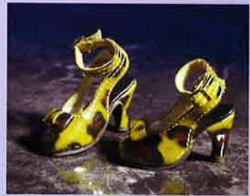
Very Vintage #014-112 $22.00