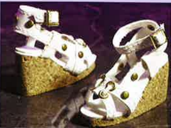
Cable Car Wedges #014-108 $22.00