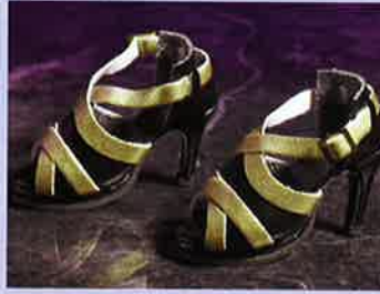
Sightseers #014-107 $22.00