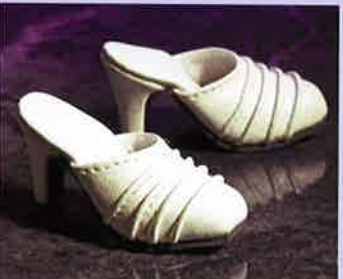
North Beach Mules #014-105 $22.00