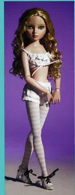
ESSENTIAL ELLOWYNE, TOO BLONDE