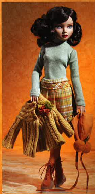
IT'S ONLY ME (outfit only)

Like days and hours that never seem right When the sun comes out and the day is bright; I'm dressed to kill but have no idea why IT'S ONLY ME I'll just stay inside