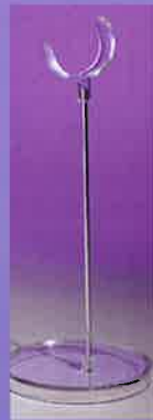
Designer Stand $10.00 015-116

Consists of all 8 wigs - $170 A savings of $30 #014-125