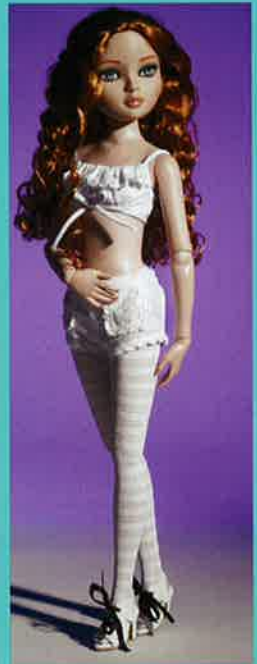
ESSENTIAL ELLOWYNE, TOO REDHEAD

Each Essential Ellowynne, Too comes dressed in a designer two piece set, striped stockings, and lace-up shoes. New designer saddle stand also included.