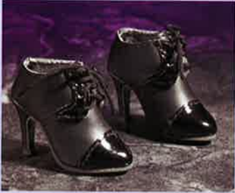
Embarcarderos #014-103 $22.00