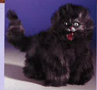
SYBIL-PLAYING NICE? Sybil comes to you as one of her more playful personalities. Plush faux fur and hand painted features - band aids not included. #015-115 - $24.00