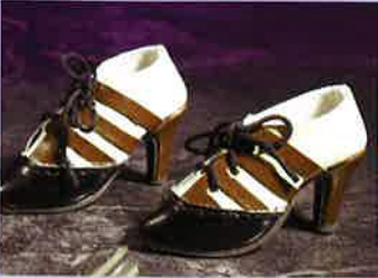
City Lace-ups #014-106 $22.00