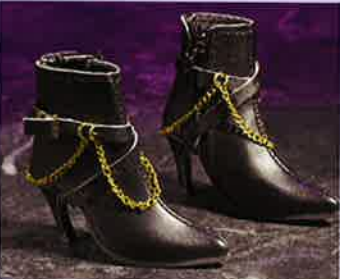
Alcaraz in Gold #014-102 $22.00