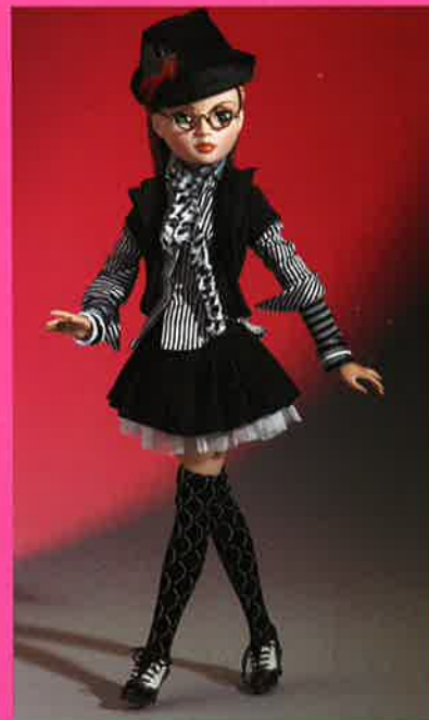
WALL STREET WOES