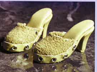
70's Chic #014-111 $22.00