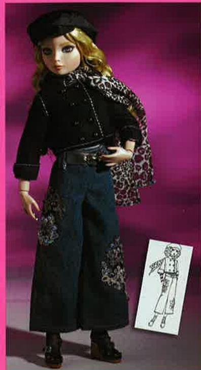
BELL BOTTOM BLUES