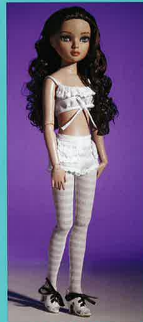
ESSENTIAL ELLOWYNE, TOO BRUNETTE